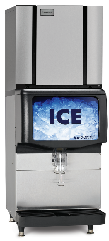
ICE320 ON CIMO320