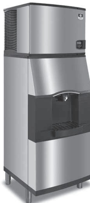
Indigo Series 450 Ice Machine SFA-291 Ice & Water Dispenser