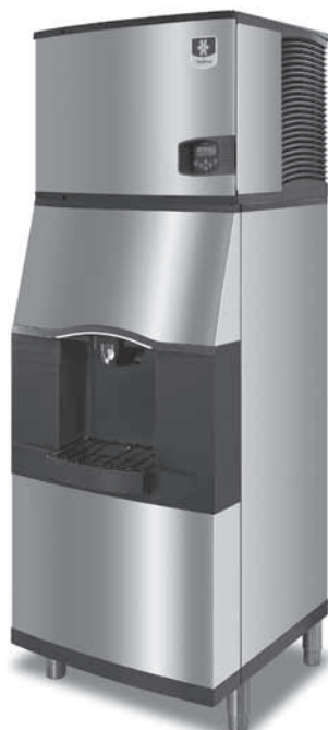
Indigo Series 450 Ice Machine SPA-310 Ice Dispenser

Ice only dispense, with coin-op and room card dispensing control options